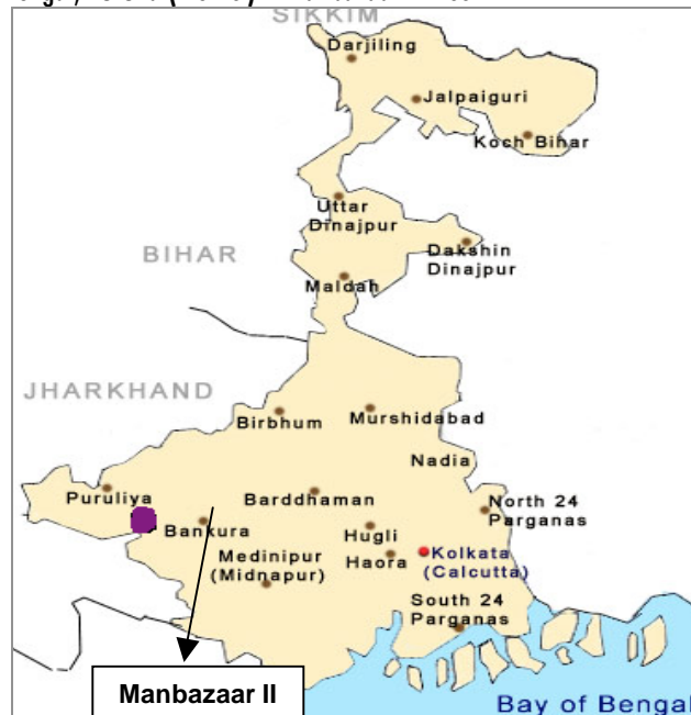
Figure 4: Map of West Bengal, Purulia (District) & Manbazaar II Block

Within Purulia Manbazaar II is a border block (one of 20 administrative subdivisions of the district) with 52% of its population belonging to Scheduled Tribes. It is an entirely rural block with a population of 85,253 (Census of India, 2001). Bararanga PACS is located in the Manbazaar II block, in a village 7 km away from the permanent road and 30 km away from the agricultural market. We requested the PACS staff to list what were the more remote areas even within Manbazaar II. Through this we were able to ascertain that nearly 70% of its 1,382 members and 75% of its SHGs live in the most remote areas of the block. 80% of the population in the area of the PACS is tribal and backward (tribal being approximately 60%).